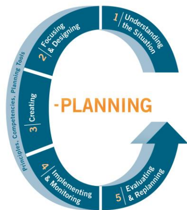
Figure 2: SBCC C-Planning

SOURCE: Adapted from Health Communication Partnership, P-Process Brochure, CCP at JHU (2003); McKee, Manoncourt, Chin, Carnegie, ACADA Model (2000); Parker, Dalrymple, and Darden, The Integrated Strategy Wheel (1998); AED, Tool Box for Building Health Communication Capacity (1995); National Cancer Institute: Health Communication Program Cycle (1989).